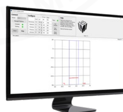
Legal for Trade Gocator Conveyor Utility