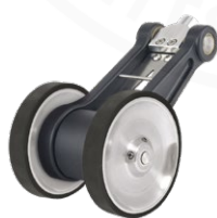
Linear Wheel Encoder